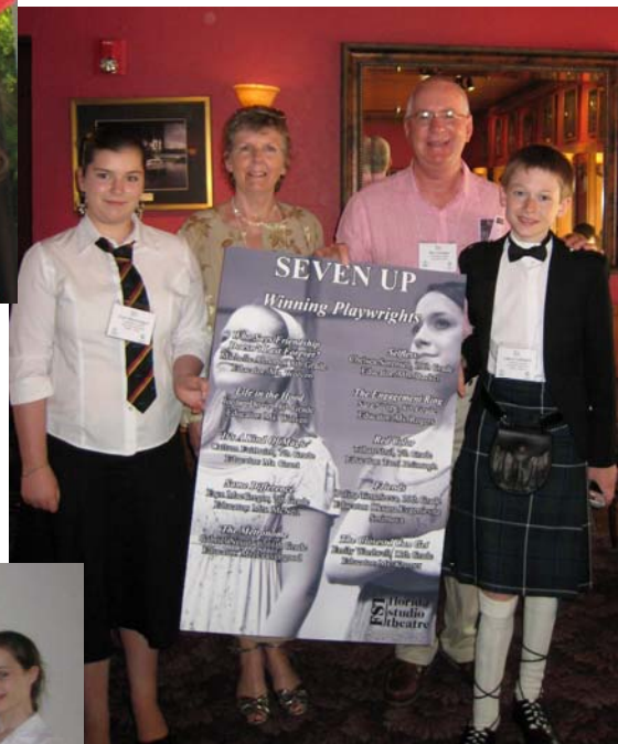
Above, The Dunfermline Delegation